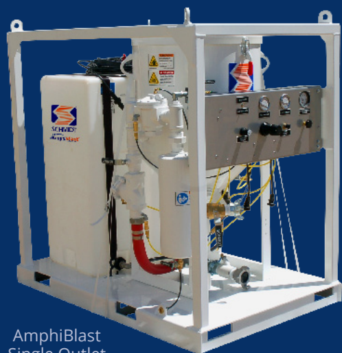
AmphiBlast Single Outlet